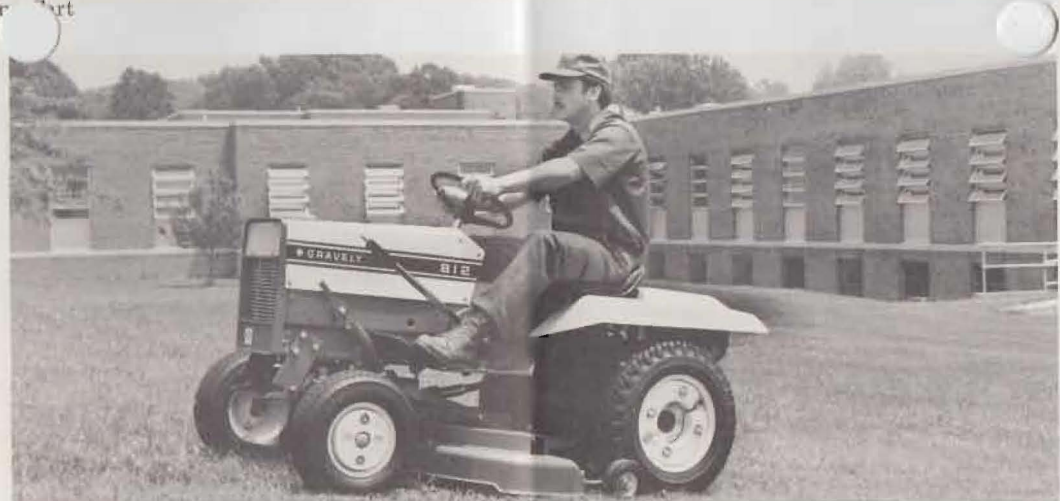
Gravely 812, 12 HP Riding Tractor with 40-inch Center Mount Rotary Mower