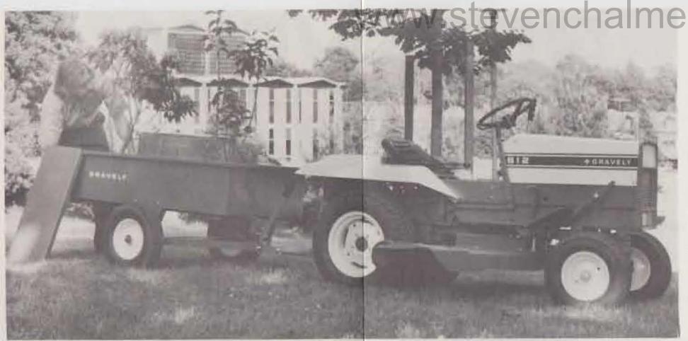
Gravely 812, 12 HP Riding Tractor wire elf-dumpir