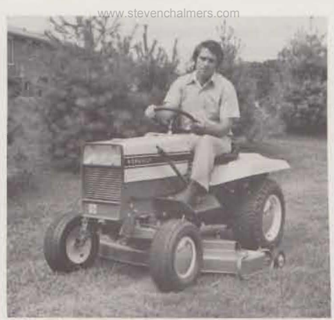
Gravely 816S, 16 HP Riding Tractor with O-inch Center Mount Rotary Mower