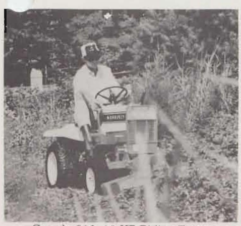
Gravely 810, 10 HP Riding Tractor with 40-inch Commercial Rotary Mower