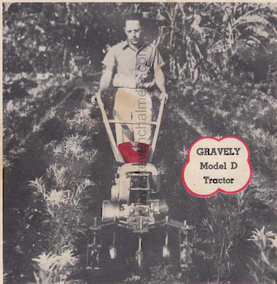
GRAVELLY Model D Tractor

WORLD'S BEST NARROW ROW POWER CULTIVATOR